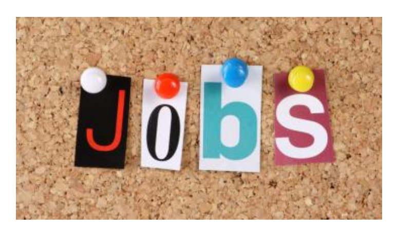
Job Opportunities at Kansas Legal Services