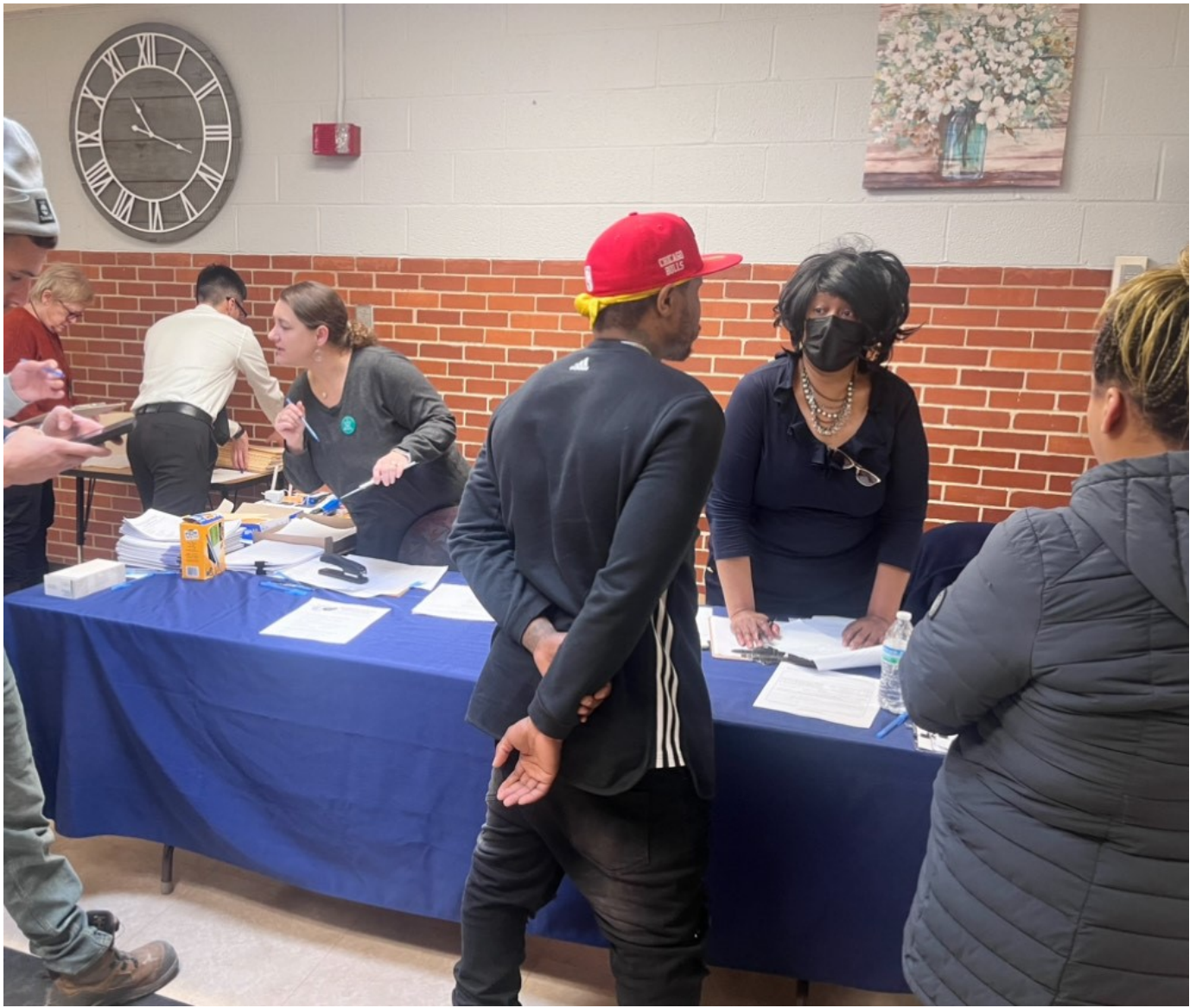
More people checking in.