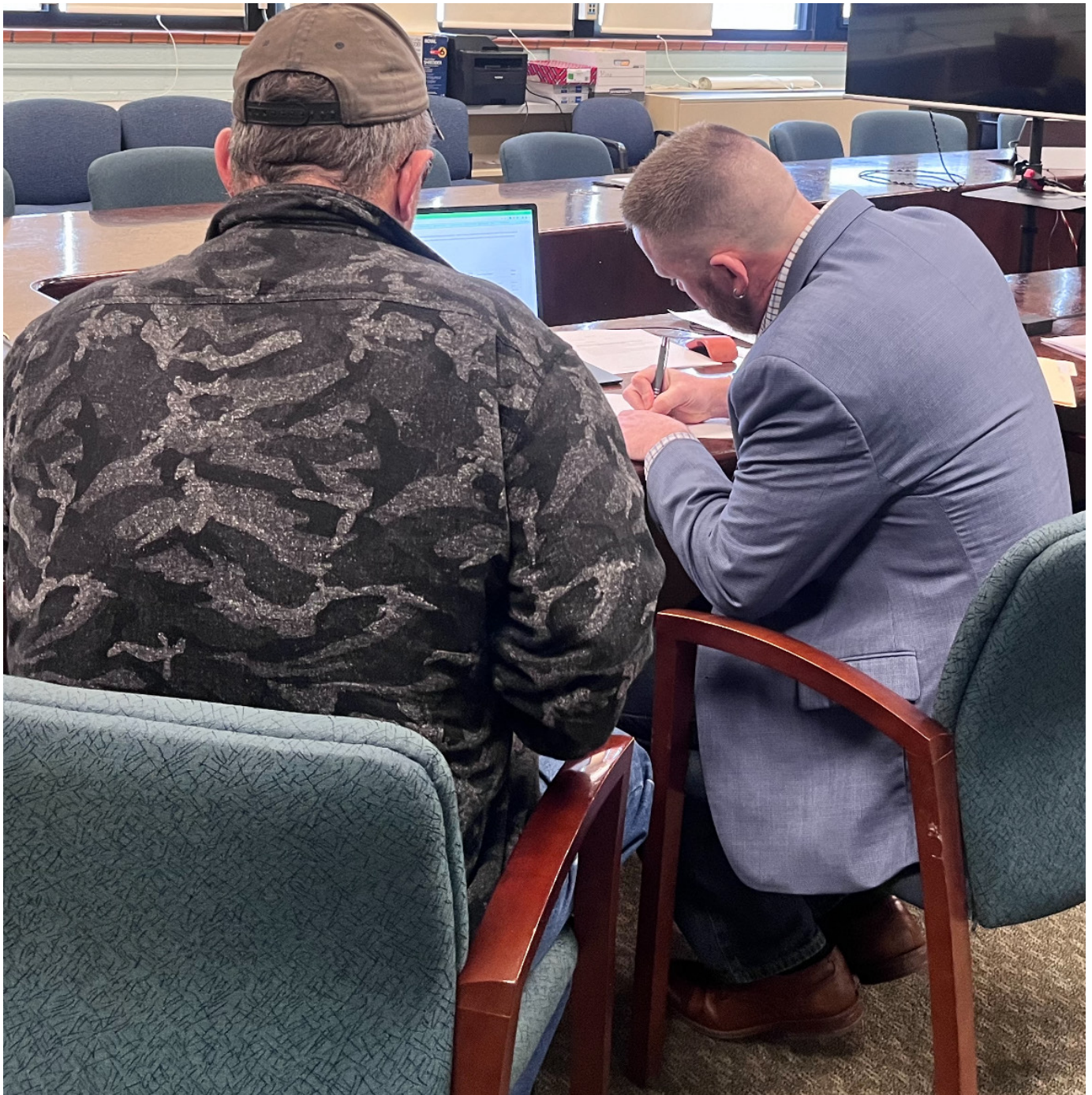
The Topeka Municipal Court staffers were a big help.