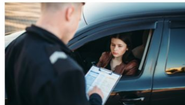
Suspended driver's license? What you can do