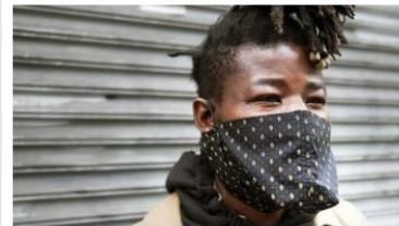
July 2020: COVID-19 What You Need to Know